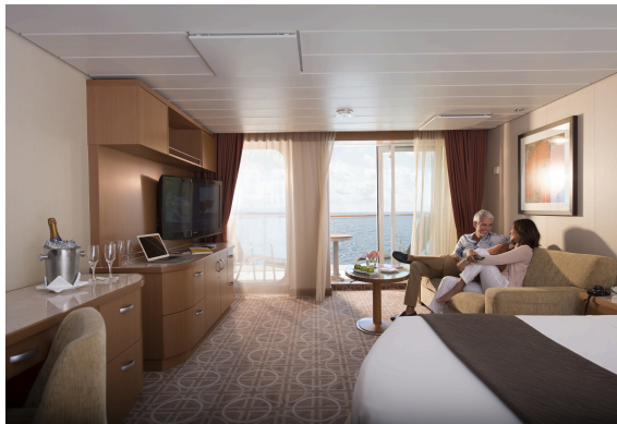
The diagram above and the photo to the left display the layout for the S1 Sky Suite.

Stateroom images and features are samples only. Actual furniture, fixtures, colors and configurations may vary. All measurements are approximate; drawing not to scale.